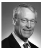
S. Robson Walton,* 61

Mr. Walton is the Chairman and CEO of Arvest Bank Group, Inc., a group of banks operating in the states of Arkansas, Missouri, and Oklahoma. Mr. Walton also serves as Chairman of Community Publishers, Inc. which operates newspapers in Arkansas, Missouri, and Oklahoma. Mr. Walton has been a member of the Board since September 28, 2005.