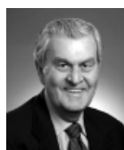
David D. Glass, 70

Mr. Daft is the retired Chairman and CEO of The Coca-Cola Company, a beverage manufacturer, where he served in that capacity from February 2000 until May 2004 and in various other capacities since 1969. Mr. Daft serves as a director of The McGraw Hill Companies, Inc. Mr. Daft has been a member of the Board since January 2005.