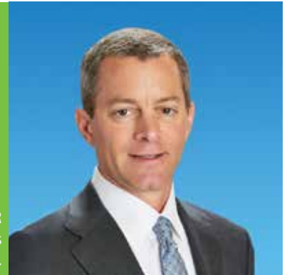
GREG PENNER Chairman of the Board of Directors Wal-Mart Stores, Inc.

The past year has been a period of transition for Walmart as we make strategic investments to position the company for sustainable growth. Management took bold steps focused on winning with customers by increasing wages and training for U.S. store associates, investing in the technology powering our websites and apps, and expanding our e-commerce fulfillment capabilities. Walmart's Board of Directors fully supports these investments in people and technology as they will strengthen the company's competitive position both now and in the future. We've challenged management to increase the pace of change even further, and we're tracking comp sales, customer satisfaction scores and growth in gross merchandise value to monitor progress on delivering this strategy.