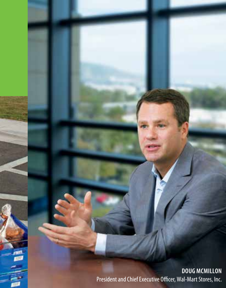
DOUG MCMILLON President and Chief Executive Officer, Wal-Mart Stores, Inc.

the best online shopping experience. And beyond just retail, they compare us with every business they interact with in their lives. They compare our pickup experience to the speed and friendliness of the best drive-through. They compare our checkout process to the ease of paying with an app.