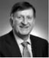
Douglas N. Daft, 63