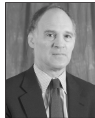
Stephen Friedman, 64 Retired in 1994 as Chairman of Goldman Sachs & Co. From 1994 to 1998, he held the title of Senior Chairman of Goldman Sachs & Co. Since 1998, he has been a Senior Principal of Marsh & McLennan Capital Corp. He is also Chairman Emeritus of the Board of Columbia University and a director of Fannie Mae. Member since 1996.