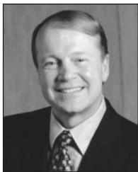
John T. Chambers, 52 President and CEO of Cisco Systems, Inc., a leading manufacturer of computer network equipment. Member since 2000.